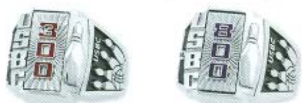
300 GAME 800 SERIES