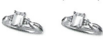
◀ 300 GAME ▶ 800 SERIES