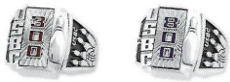
◀ 300 GAME ▶ 800 SERIES