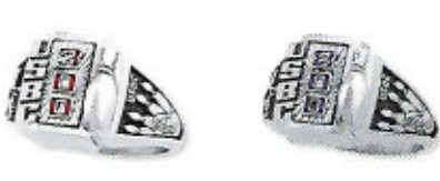
◀ 300 GAME ▶ 800 SERIES