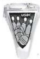
▶ No Personalization (Standard) No Charge