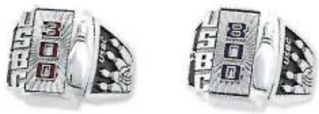
300 GAME 800 SERIES