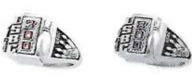
300 GAME 800 SERIES