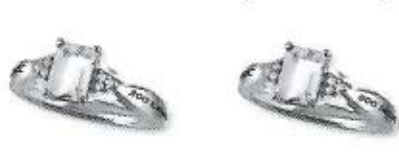
300 GAME 800 SERIES