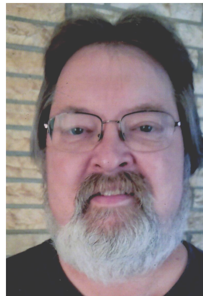
State Tournament Squad Leader Annually 25-30 teams for 20+ years Tournament Participation—30 years League Secretary—35+ years